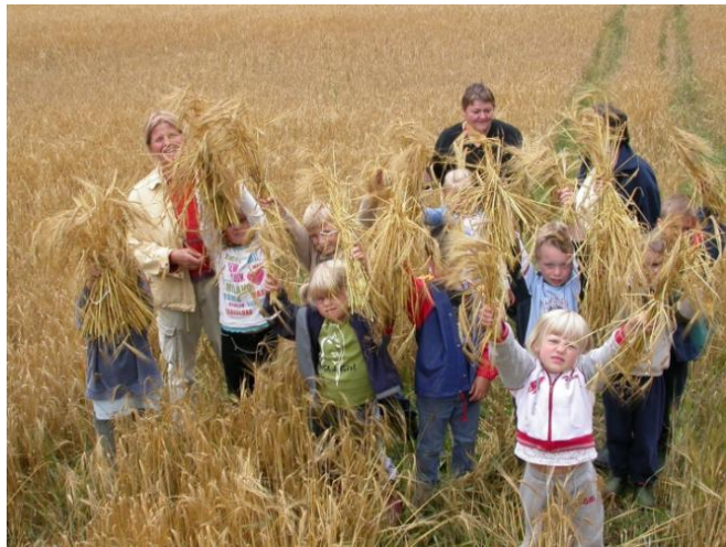
Figures 4 and 5. First graders harvesting grain and second graders harvesting potatoes

grow outside the classroom window. In the fields at the farm they sow grains, harvest them with small sickles, ground them in a hand mill and bake bread (Figure 4). The second grade has potatoes as theme, from planting to harvesting to making local, traditional products (Figure 5).