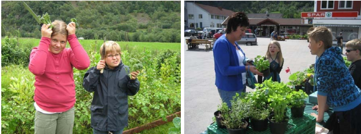
Figures 8 and 9. Fifth graders having fun harvesting and selling plants in the local market

In the sixth and seventh grades, the emphasis is on homemaking and conserving fruits and vegetables, both from their own garden and from harvests at the farm. The students also begin to work in the forest, learning to use both saws and axes and stack wood for the winter. They make milk products, press juice from apples, pears and plums, and create a feast for their parents. The students are also employed by the mountain management board to set nets and evaluate the fish populations in mountain lakes (Figures 10 and 11).