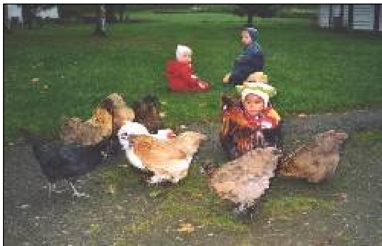
Figures 2 and 3. Kindergarteners with chickens and harvesting vegetables

The connection to outdoor work with nature is established in the kindergarten, which is located in the middle of the farmyard of the agriculture high school. The children see harvests and animals, as well as youth and adults with their tools and machines as they come and go from the fields. In their own garden, each kindergartener has a bed for vegetables and flowers. The kindergarten also has its own chickens, which are tended by the children (Figure 2). In addition, the children go to the farm with their teachers to get milk, harvest vegetables, pick berries and other fruits that they use for their own meals (Figure 3).