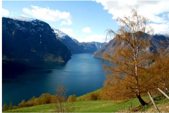
Figure 1. Aurland landscape

The connection to outdoor work with nature is established in the kindergarten, which is located in the middle of the farmyard of the agriculture high school. The children see harvests and animals, as well as youth and adults with their tools and machines as they come and go from the fields. In their own garden, each kindergartener has a bed for vegetables and flowers. The kindergarten also has its own chickens, which are tended by the children (Figure 2). In addition, the children go to the farm with their teachers to get milk, harvest vegetables, pick berries and other fruits that they use for their own meals (Figure 3).