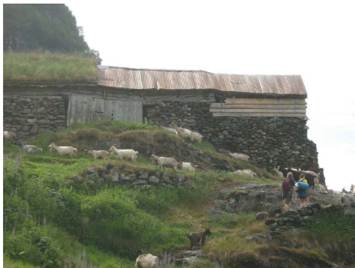
Figures 6 and 7. Following the goats to the mountain farm with supplies by horseback

The animals on the farm bring the children farther out into the landscape. The themes of sheep in third grade, horses in fourth and goats in fifth grade include trips to the grazing meadows, following the animals to the mountains, spending a night in the summer huts and making cheese (Figures 6 and 7).