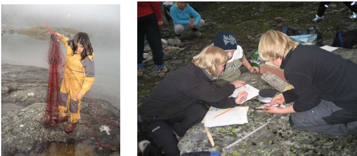
Figures 10 and 11. Students setting nets and charting fish populations for the mountain management board

In the sixth and seventh grades, the emphasis is on homemaking and conserving fruits and vegetables, both from their own garden and from harvests at the farm. The students also begin to work in the forest, learning to use both saws and axes and stack wood for the winter. They make milk products, press juice from apples, pears and plums, and create a feast for their parents. The students are also employed by the mountain management board to set nets and evaluate the fish populations in mountain lakes (Figures 10 and 11).