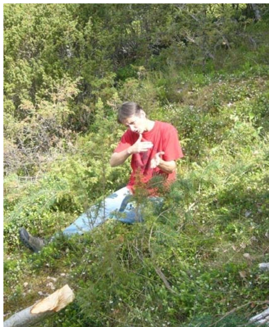
Figures 12 and 13. A local farmer describes the task; the students rest from their work of clearing the timber flow

In junior high school the students take on the responsibility of cultivating the landscape around the local folk museum as they learn about the cultural history of their community. This project brings the students into contact with a local mountain farmer (Figure 12) just above the folk museum, as they participate in restoring old timber flows (Figure 13).