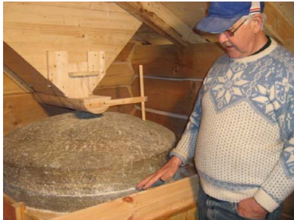
Figures 14 and 15. A water mill used to grind grain; students serve their rolls to a volunteer farmer